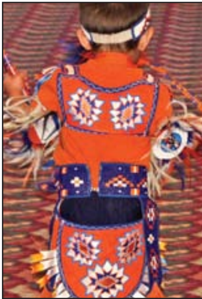
Left: One of the youngest dancers at the powwow takes a spin around the dance floor.