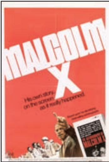
One of the poster featured in the Imaging Blackness exhibit. Malcolm X Documentary 1972. Offset lithography 40 x 27 Copyright: Warner Brothers.

A new exhibition titled "Imaging Blackness, 1915-2002: Film Posters from the Indiana University Black Film Center Archive" opens Jan. 5, 2009 at Mari Sandoz High Plains Heritage Center.